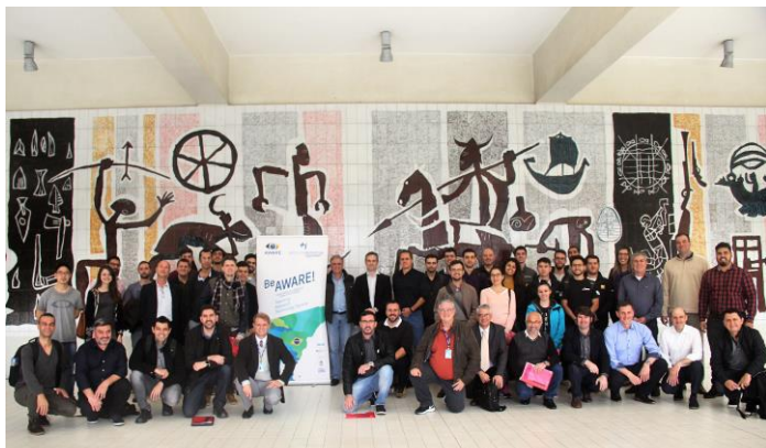
Participants of the International Workshop 4.0 at UFPR